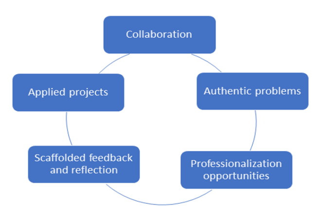
Figure 1. Model of key STEM Collaboration components

and in math (Parks & Wager, 2015). However, we know less about how pre-service teacher preparation programs can influence skills and knowledge in teaching science and integrated STEM, the extent to which these impacts last into teaching careers, and whether we can support transformative learning in regions like rural Appalachia. In addition, no studies we found addressed these issues and connected traditionally separate worlds of early childhood and elementary programs.