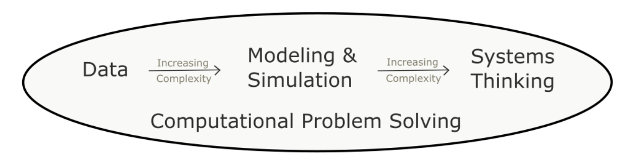
Figure 1. Computational Thinking as a Continuum of Practices

At the elementary level, we speculate that if Computational Problem Solving is considered as an opportunity to represent the tools and techniques used in Data, Modeling and Simulation , and ST practices, it would be developmentally appropriate. By doing so, teachers would prepare young learners to engage first with Computational Problem Solving in a tangible manner with engaging educational tools such as developmentally designed robots, which would prepare them to engage in a more conceptually and technical manner with the core practice in middle school science and beyond.