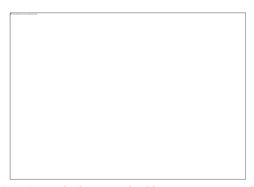
Figure 2. Example of science teachers' drawings representing in level 2 A: Melting Polar- Extinction of the some plant/animal species