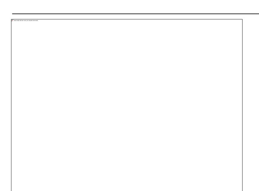
Figure 5. Model drawing

world, 5 of them focus on two- and three and more-dimensional specimens of GCC. and, 4 of them (see Figure 4) focus on symbols/actions/solutions to protect the future world.