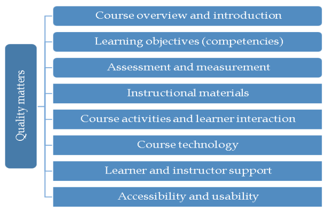
Figure 1. Quality matters rubric