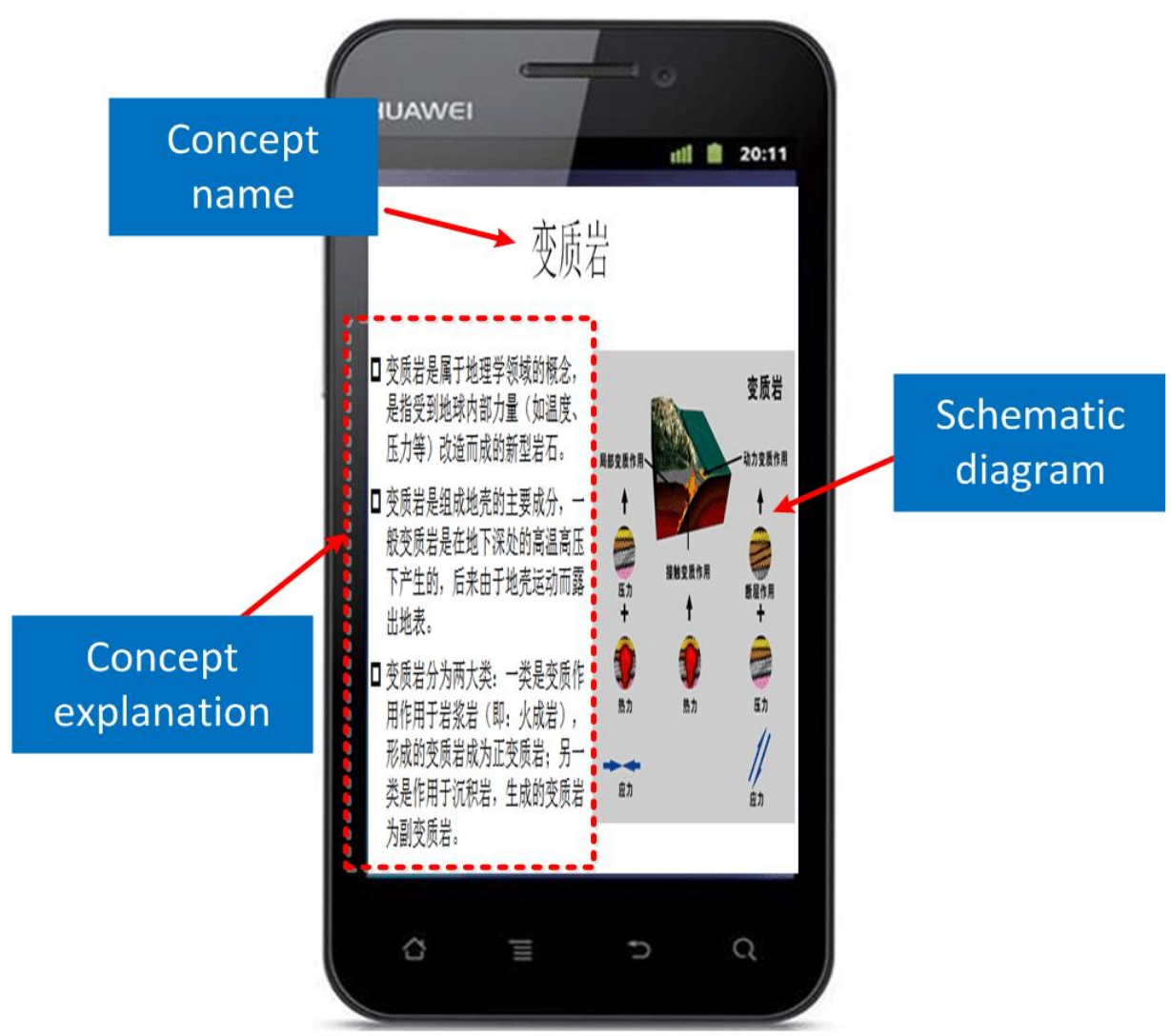
Figure 1. Graphical courseware