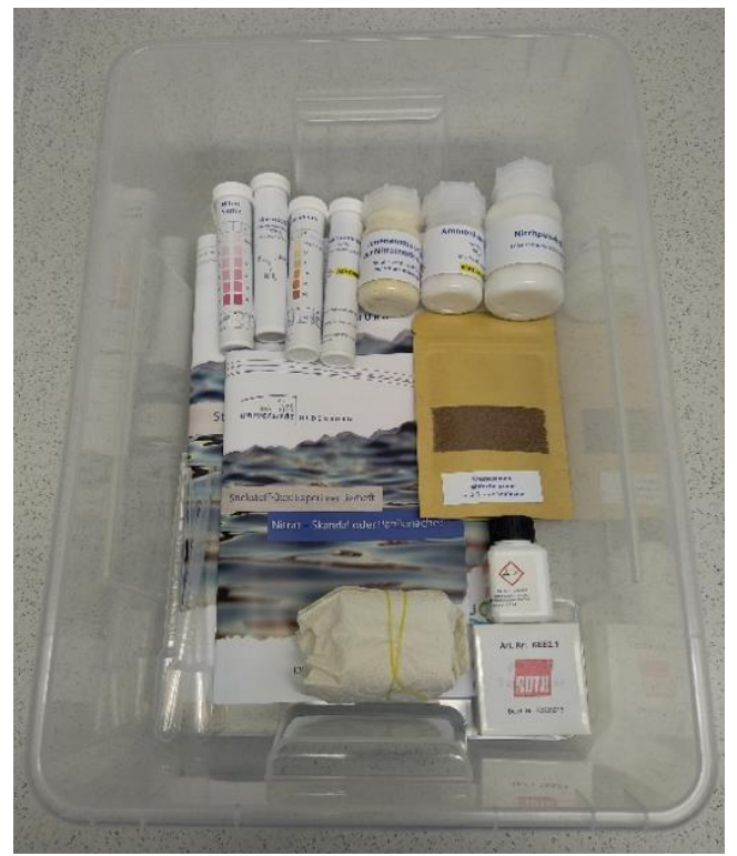
Figure 2. The nitrogen box

achieved with the experiments (Lyall & Patti, 2010). Since, in contrast to the school and university context, the prior knowledge and experience of citizens is often unknown and the age structure is also extremely diverse, providing experiments and materials in the citizen science context can be particularly challenging.