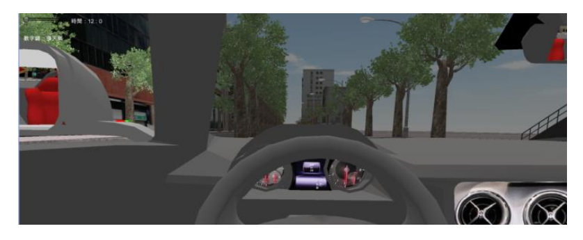
Figure 3. The driving behavior for different weather- sunny

Figure 2. Descriptive statitics diagram for different background variables