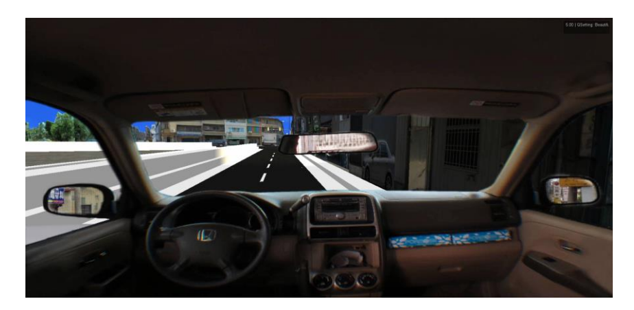
Figure 5. Impacts caused by vehicles for different environmental conditions in driving process